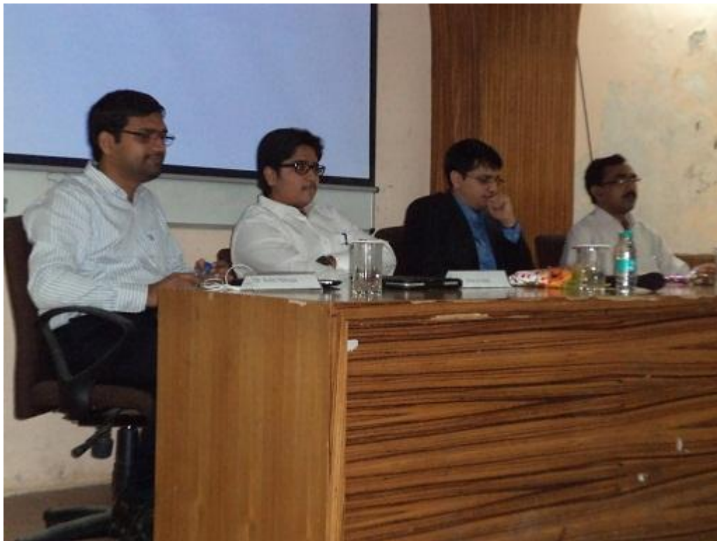
Experts At Idea Generation Competition..